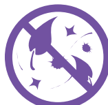
Eliminates volatile organic compounds (VOCs)