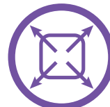
Purifies up to: 2,000 sq.ft.