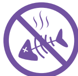
Eliminates odors and chemical contaminants